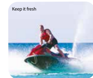
Keep it fresh