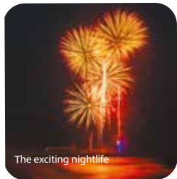
The exciting nightlife