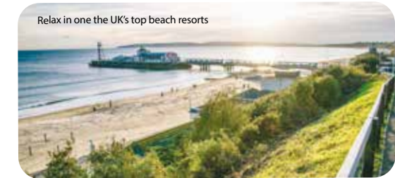
Relax in one the UK's top beach resorts