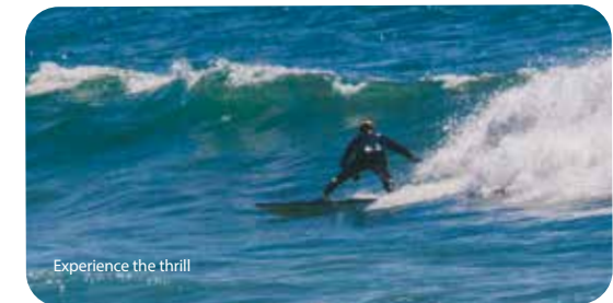
Experience the thrill