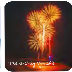
The exciting nightlife