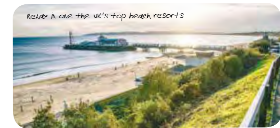
Relax in one the UK's top beach resorts