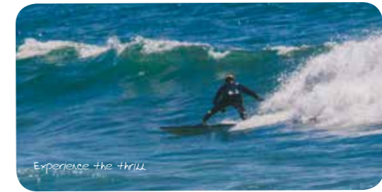
Experience the thrill