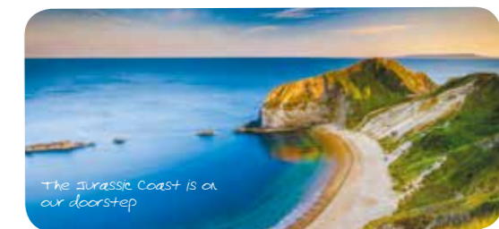
The Jurassic Coast is on our doorstep